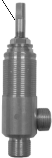
EXISTING 1/2" VALVE